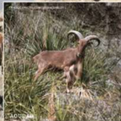
Shaggy beard on both ewes and rams